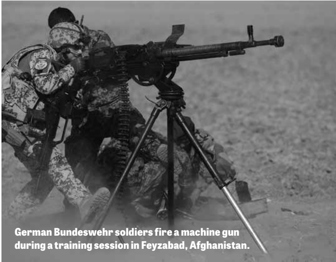
German Bundeswehr soldiers fire a machine gun during a training session in Feyzabad, Afghanistan.

It can also mean terror-stricken, or shivering with fear, invoking the creeping of the skin of one who is terror-stricken.