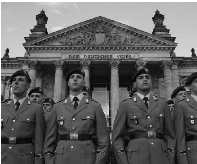
New German Bundeswehr recruits in front of the Reichstag

the Houthis are against al Qaeda, but the real issue is that the Houthis are a client of, supported by, and in some ways advised by Iran. And as you saw on the map, the Saudis are looking at the Iranians in the north, the Iranian allies—which is essentially Iraq, Syria and Lebanon on one side—and Yemen now to the south and west under Iranian dominance, and THEY ARE SCARED TO DEATH . That's why this is a double attack on us. It's the loss of an ally against al Qaeda, and it's a HUGE geopolitical gain for Iran, extending its influence over Arab states" (Jan. 22, 2015).